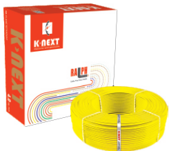
HOUSE-GARD-FLAME RETARDANT (FR) (45 Mtr)

Packing : Supplied in Attractive Cartons. (Box | Pouch Packing)