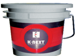
P.V.C INSULATED SINGLE CORE UNSHEATHED SOLID (450 Mtr)