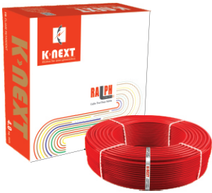
HOUSE-GARD-FLAME RETARDANT (FR)

Packing : Supplied in Attractive Cartons.