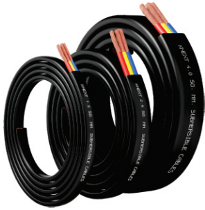
3 CORE FLAT SUBMERSIBLE CABLES