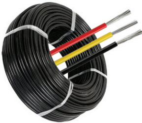
PVC INSULATED SINGLE CORE UNSHEATHED STRANDED ALUMINIUM WIRE