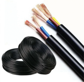
PVC INSULATED & PVC ROUND-SHEATHED MULTI CORE CABLE