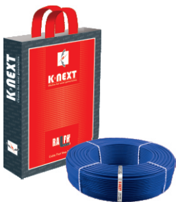
P.V.C INSULATED SINGLE CORE UNSHEATHED SOLID

Packing : Supplied in Attractive Cartons, Polythene, Woven Bags and Cloth Packing Longer length available on request