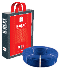
PVC INSULATED SINGLE CORE UNSHEATHED SOLID